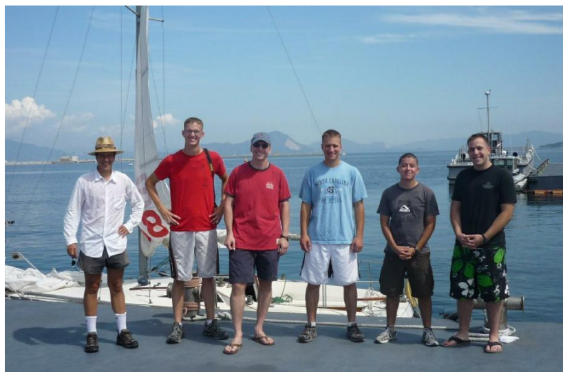
ASTR-100 students ready for an evening observing a meteor shower

Geology and astronomy classes were popular at Iwakuni, perhaps because of these field trips aboard Daisy . UMUC's field representative (Yiraliz Beltran) noted that my geology and astronomy classes were always the first classes to fill up every term.