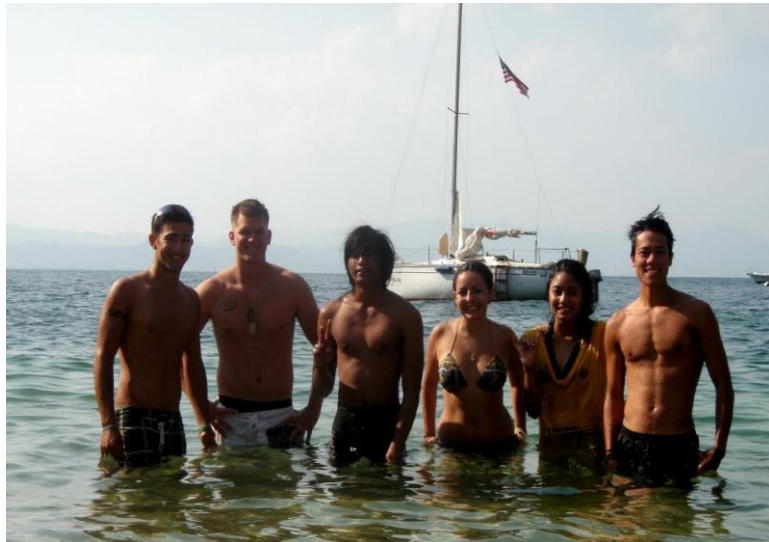
GEOL-100 students prepare for finding pillow basalts and collecting rock samples under water

Daisy was also useful for astronomy field trips because it allowed us to get away from the city glare of Hiroshima. Sailing on the Setonaikai was not difficult, day or night. For most of the year, there were reliable southerly breezes off the Pacific. The shipping lanes and maritime hazards were well marked. With the protection of many small islands, there were no large ocean swells. From Iwakuni's marina, it wasn't far to the other side of one of the larger islands where we could get dark night skies.